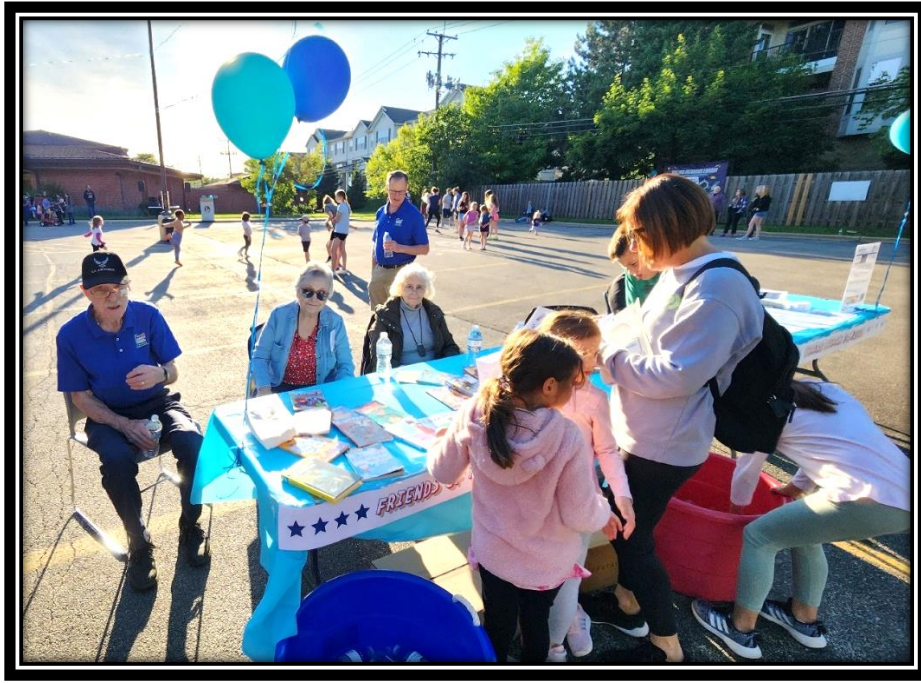
Photos from the Summer Reading Kickoff Event Adventure Is Out There

The Friends of the Library also had a table at the Summer Reading Kickoff Event. They were positioned near the popular ice treat line where they distributed free books, water bottles and recruited new members.